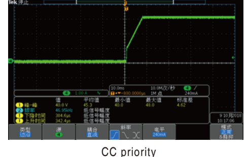
no current priority