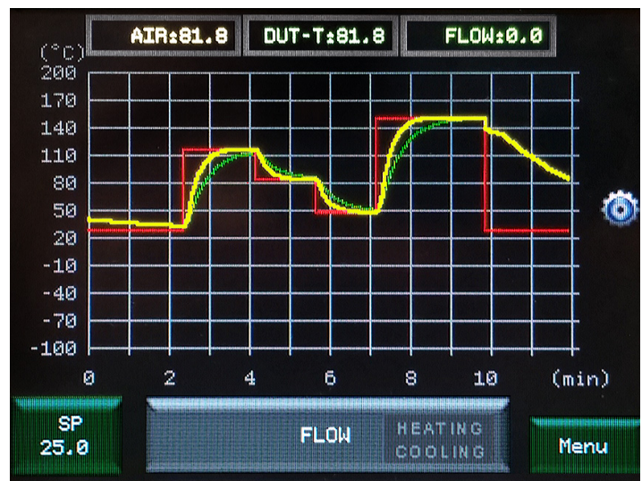
Data Graphing Screen